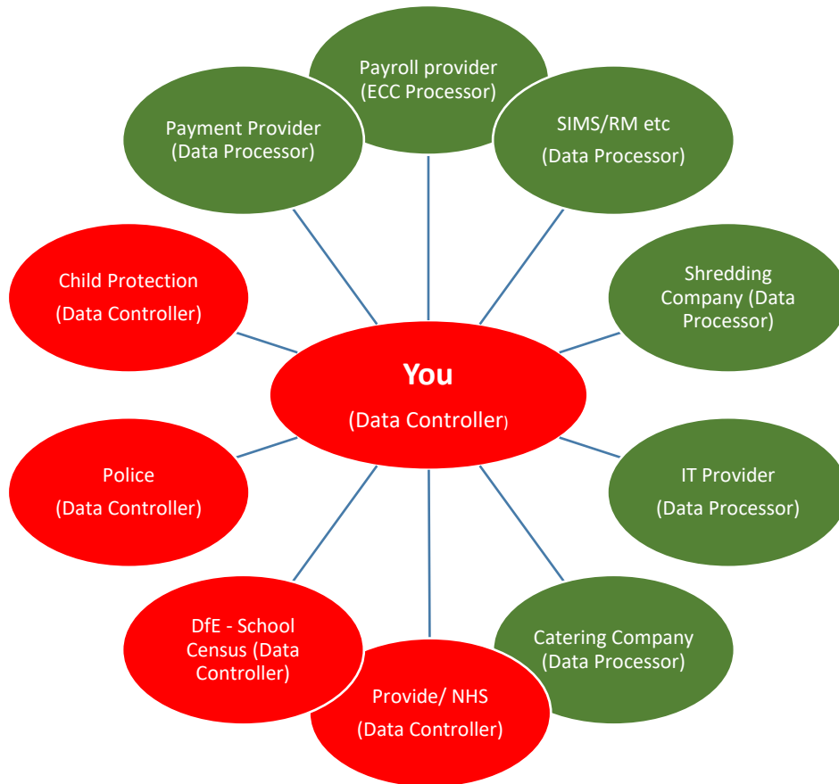
Diagram showing the types of Data Processor a school may work with (Green), and the types of sharing that may occur with other Data Controllers (Red).